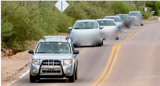
Figure 2: Platoon of vehicles in experiment with lead vehicle followed by four test vehicles and a safety chase vehicle. Test vehicle fronts blurred to remove branding.

different vehicles. In each experiment, a lead vehicle drives with a pre-determined speed profile. The following (test) vehicle then drives behind the lead vehicle with ACC engaged. The position and speed of each vehicle are measured with high-accuracy GPS receivers on each vehicle. Additionally, overhead video footage is recorded with a drone.